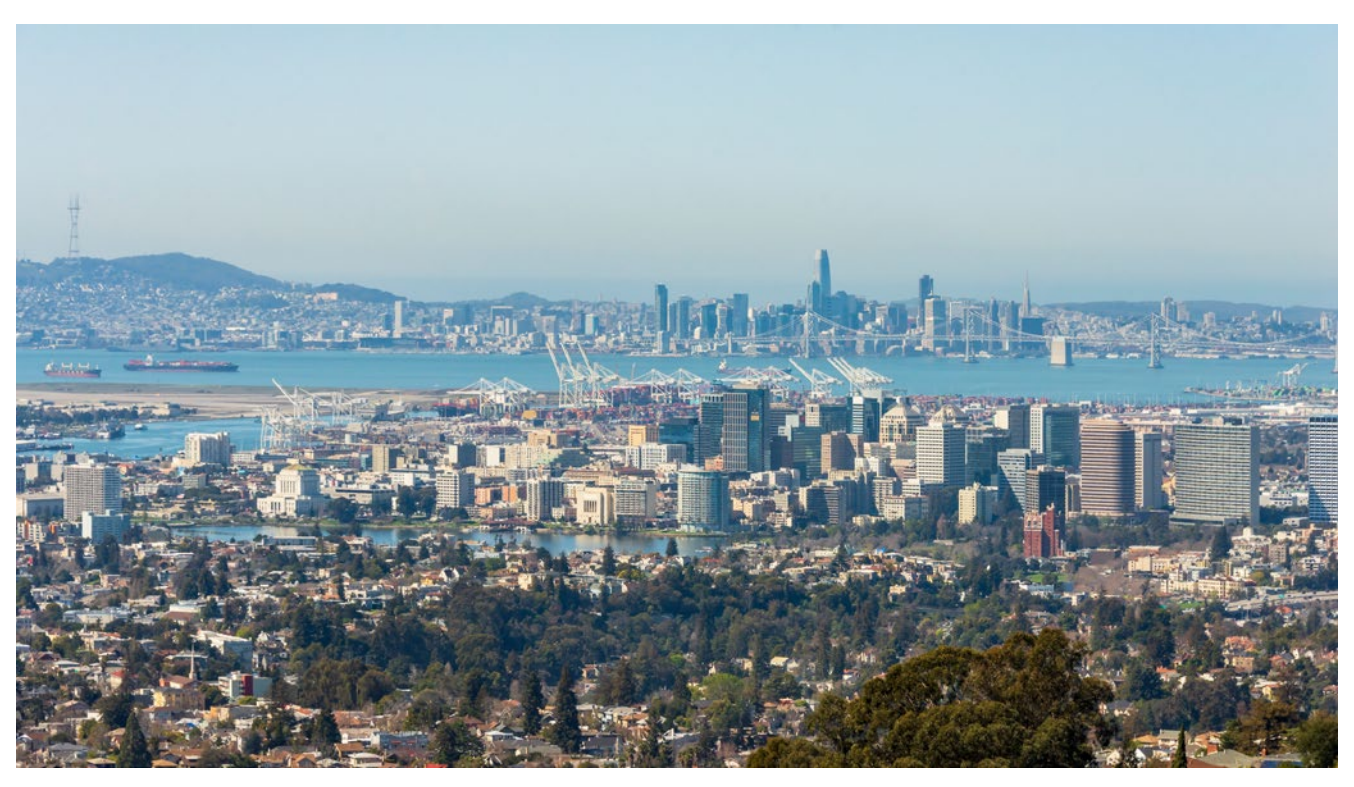
Oakland lies at the geographical center of the region, making it the sensible home for a future transit hub.

Proposals to rectify the impacts of regional infrastructure on Oakland and reimagine the city's landscape, such as undergrounding I-980, have long been considered "moonshot" ideas. However, 2021 finds the region in a new moment. Through programs such as Link21, a study of rail investments that would connect the 21 counties in the Northern California megaregion, and with federal funding through the recently passed American Rescue Plan and proposed infrastructure bills, the Bay Area is poised to make once-in-a-generation investments in its transportation infrastructure. These proposals indicate that political will is growing at the local, state and federal levels to address the crises that today's auto-oriented system perpetuates: racial and environmental injustice, the housing crisis and the climate crisis.