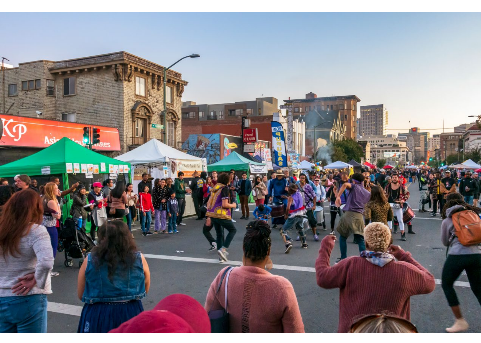
Public events like First Fridays play an important role in elevating Oakland's culture and keeping its communities intact.

development and increase local employment opportunities. Oakland could enact stronger policies that support anti-displacement measures, community wealth-building and placemaking as the local economy expands as a result of transit investments. However, without a clear vision for how the regional investments will benefit Oakland, and how the projects align, there is a risk of history repeating itself.